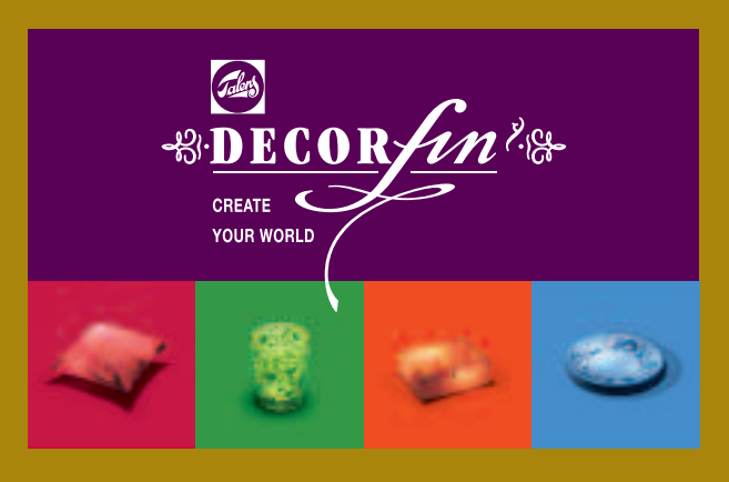
Antique Colour Patina Varnish & Primer

The Talens website is packed with information on all Decorfin paint types and related products. You can find us at www.talens.com. In addition there are leaflets on the other types of Decorfin paint, such as Universal Satin & Gloss, Glass, Porcelain, Textile, Silk and Spray Paint.